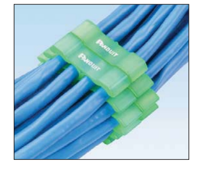
Step 2 Insert cables, one at a time, into the pre-formed slots of both inserts until all cables are installed.