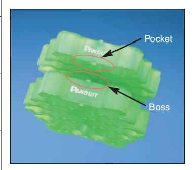
Step 1 Use the unique pocket and boss features to align two same color inserts. Hold both together.

The steps below outline how easy it is to use the Panduit cable bundle organizing tool starting from the middle of the bundle outwards, using two tools. For starting at the end of the bundle, follow the same steps using only one tool. (Use above table to select appropriate insert based on cable diameter/type.)