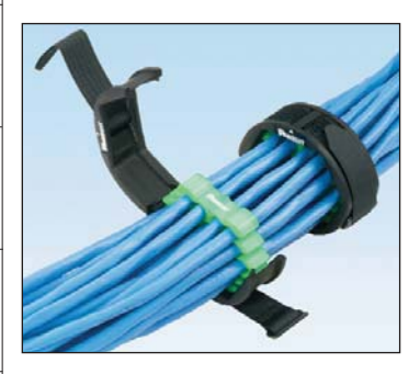
Step 4 Place the jacket cover around each insert and secure with the attached hook and loop fastener.