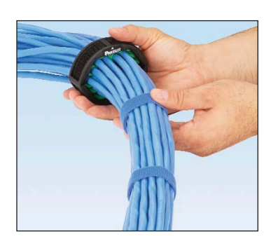
Step 5 Guide the tool along the bundle length to organize the cables, stopping at desired intervals to apply Panduit Network Cable Ties.