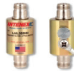
Lightning Arrestor LABH350NN (Sold Separately)