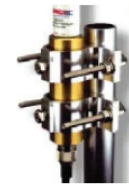
FM2 Mounting Kit (Sold separately)

Americas: +1.847.839.6925 IAS-AmericasSales@lairdtech.com