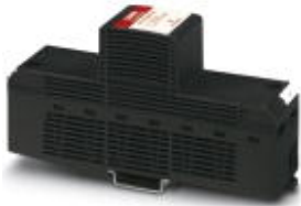
The illustration shows version FLT-PLUS CTRL-0,9

Please be informed that the data shown in this PDF Document is generated from our Online Catalog. Please find the complete data in the user's documentation. Our General Terms of Use for Downloads are valid ( http://phoenixcontact.com/download )