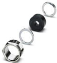
Cable gland, shielded: no, cable diameter range: 8 mm ... 12 mm

Please be informed that the data shown in this PDF Document is generated from our Online Catalog. Please find the complete data in the user's documentation. Our General Terms of Use for Downloads are valid ( http://phoenixcontact.com/download )