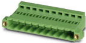
The illustration shows a 15-position version

Please be informed that the data shown in this PDF Document is generated from our Online Catalog. Please find the complete data in the user's documentation. Our General Terms of Use for Downloads are valid ( http://phoenixcontact.com/download )